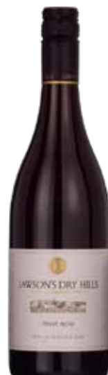
LAWSON DRY HILLS PINOT NOIR, MARLBOROUGH NET £10.27

Wonderful new Marlborough Sauvignon at a great price.