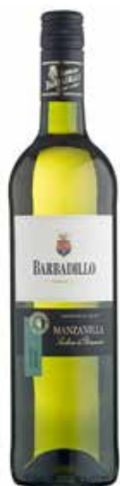
BARBADILLO MANZANILLA EXTRA DRY, SHERRY