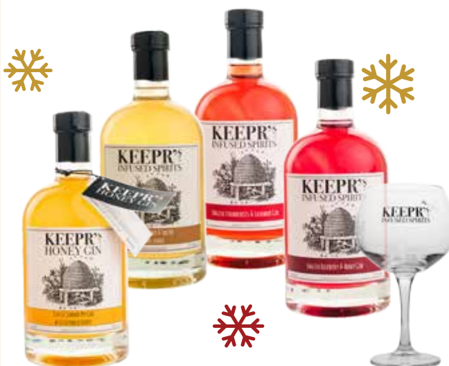
KEEPRS HONEY GIN 40% NET £27.43

BUY ANY 4 BOTTLES OF KEEPRS AND GET 6 FREE GLASSES