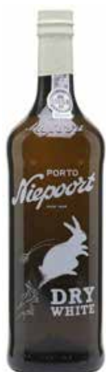
NIEPOORT 'WHITE RABBIT' DRY WHITE PORT