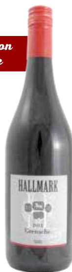
SIMON HACKETT 'HALLMARK' GRENACHE, MCLAREN VALE NET £6.98