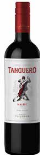
FINCA FLICHMAN 'TANGUERO' MALBEC NET £5.98