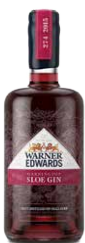
WARNER HARRINGTON SLOE GIN 30% NET £21.63

BUY ANY 4 BOTTLES OF KEEPRS AND GET 6 FREE GLASSES