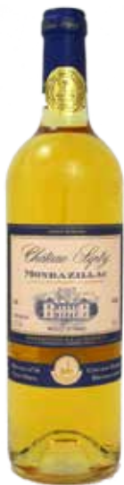
CH. SEPTY 2014, MONBAZILLAC, FRANCE NET £9.35