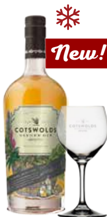
COTSWOLD GINGER GIN 46% NET £27.70

BUY ANY 6 BOTTLES OF COTSWOLD AND GET 6 FREE GLASSES