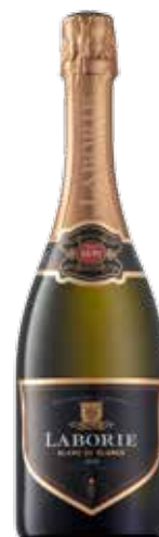
LABORIE BLANC DE BLANCS BRUT, SOUTH AFRICA