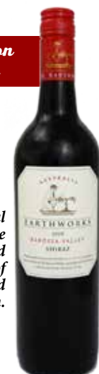
EARTHWORKS SHIRAZ, BAROSSA VALLEY NET £8.48

This powerful red displays the rich, sun-filled flavours of this favoured region.