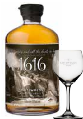
COTSWOLD 1616 BARREL AGED GIN 46% NET £23.40