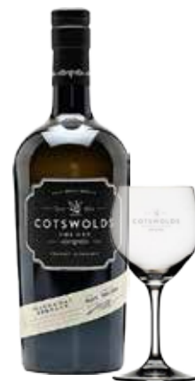
COTSWOLD DRY GIN 46% NET £23.40