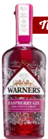
WARNER RASPBERRY GIN 40% NET £27.70