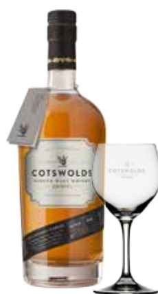
COTSWOLD SINGLE MALT WHISKY 46% NET £34.39