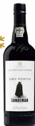
SANDEMAN LBV PORT