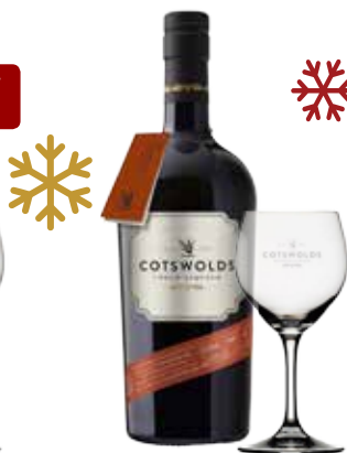
COTSWOLD CREAM LIQUEUR 17% NET £17.36