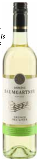
BAUMGARTNER GRUNER VELTLINER, WEINVIERTEL NET £6.38

Gruner Veltliner is Austria's signature grape. It is fresh, juicy and food-friendly.