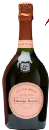
CHAMPAGNE LAURENT PERRIER BRUT ROSÉ NV