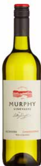
MURPHY'S UNOAKED CHARDONNAY, BIG RIVERS NET £4.99